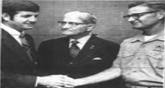
THREES NOT A CROWD