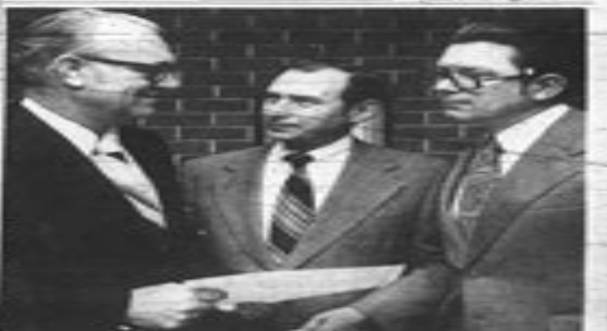
CERTIFICATE OF THANKS