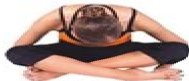
Uthita Anguli Sukhasana

It stimulates the abdominal organs and lungs. It improves the circulation of prana and our vital energy.