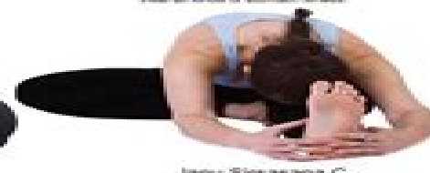
Janu Sirsasana C

This posture stimulates the digestive organs. It also releases lower back pain caused by muscular tension.