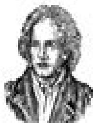
Ludwig van Beethoven 1770-1827 A.D. German composer and piano virtuoso whose music is among the best of all time