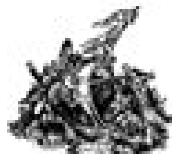
Battle of Waterloo

June 18, 1815 A.D. The final battle to end the Napoleonic Wars and mark the end of Napoleon's reign. The British, Prussians, and Dutch defeated the French army, leading to the fall of Napoleon and the end of his reign.