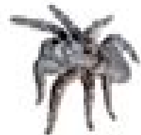
Horned Baboon Tarantula