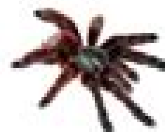
Hercules Baboon Tarantula