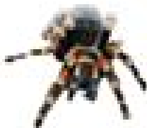
Mexican Red Knee Tarantula