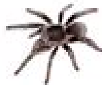
Cameroon Red Baboon Tarantula