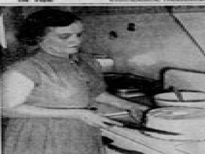
Woman judges cake at show.

Oklahoma City, May 4.—The annual Home Demonstration (HD) cake show, held at the Oklahoma State Fairgrounds today, drew a record 29 entries. The judges, who were selected from a list of 100, spent the day evaluating the cakes on taste, appearance, and creativity. The winners were announced at a ceremony held at the fairgrounds, where the prize-winning cakes were displayed for all to see.