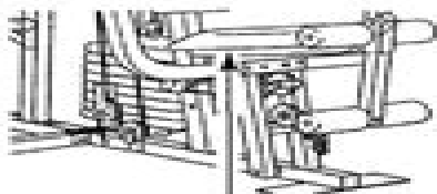
Serial Number Decal

(Write the serial number in the space above for reference.)