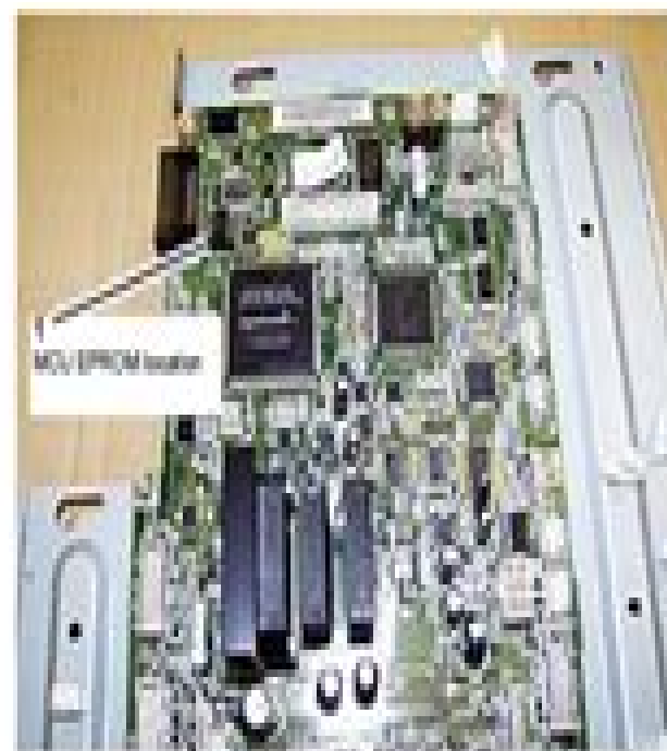
Figure 4 MCU PWB EPROM location