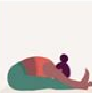
Seated Forward Fold