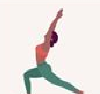
Warrior 1 Pose