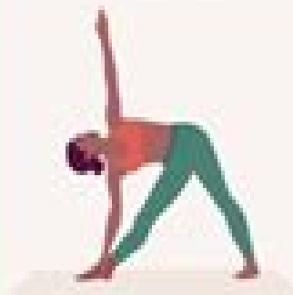
Extended Triangle Pose