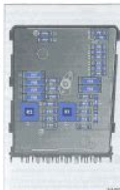
Fig. 41 Fusibles de la caja de fusibles del vano motor, Versión A (Low Box)