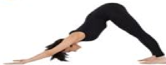
Downward Facing Dog