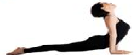
Upward Facing Dog