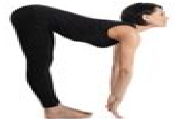
Standing Half Forward Bend