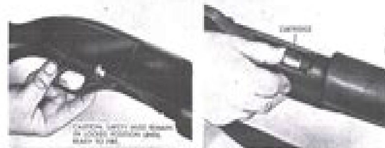
FIG. 2. PULL SLIDE TO "OFF" POSITION.