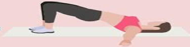
2. PILATES BRIDGE