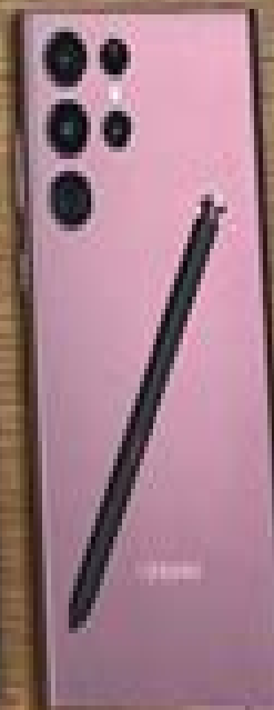
Galaxy S22 Ultra