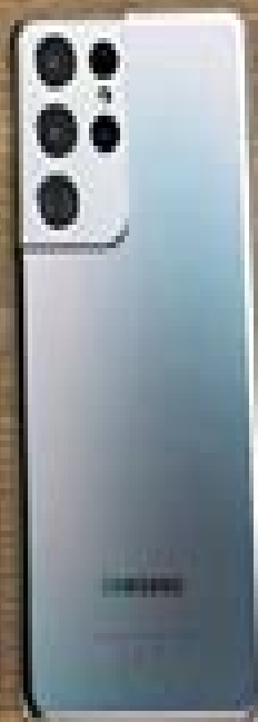
Galaxy S21 Ultra