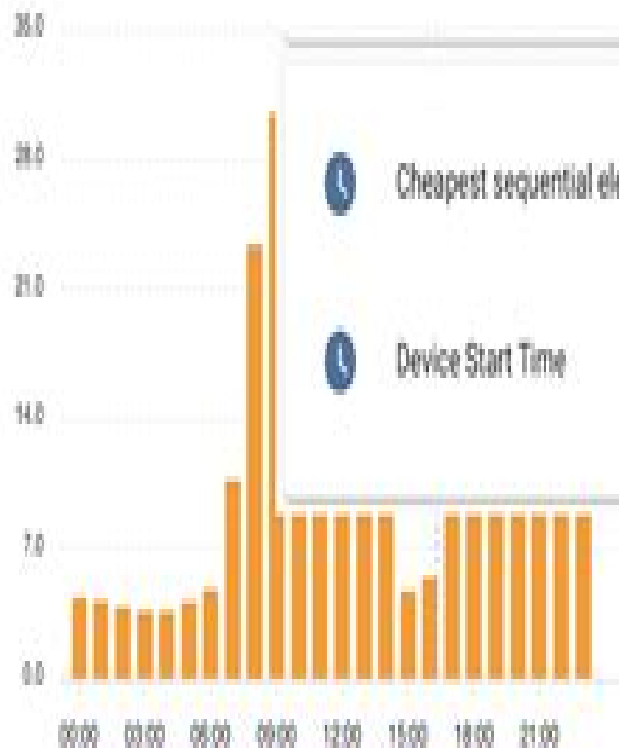
Energy price today (¥/kWh)