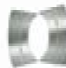
连杆轴瓦 shaft bush