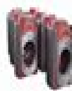
十字头 cross head