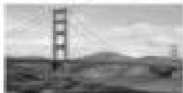
The Golden Gate Bridge

Read the selection and write the best answer to each question. Read the selection and write the best answer to each question. Read the selection and write the best answer to each question.