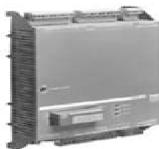
NRK16/A (with NSA)

Especially suitable for use in small heating, ventilation and air conditioning systems.