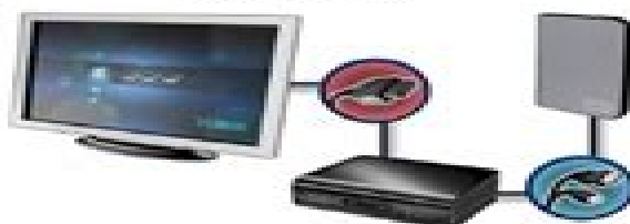
Digital Audio (High Definition)