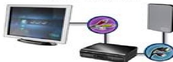
Home theater (High Definition)