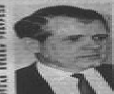
Respected artist slated to judge at Country Fair

A respected artist is slated to judge at the Country Fair. A respected artist is slated to judge at the Country Fair. A respected artist is slated to judge at the Country Fair.