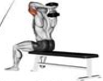
DB Overhead Extension