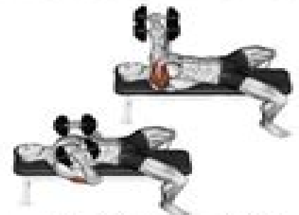
DB Close-Grip Bench Press