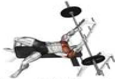
Close-Grip Bench Press