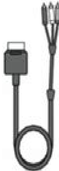
Composite AV cable