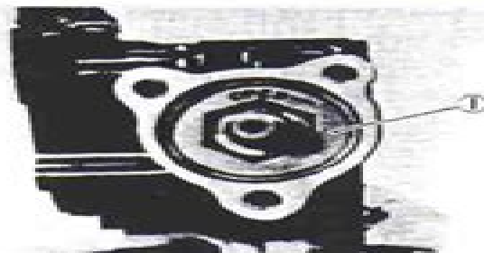
1. Bearing retainer nut

The middle-drive-shaft-bearing-retainer nut has left-hand threads. Turn the retainer nut clockwise to loosen it.