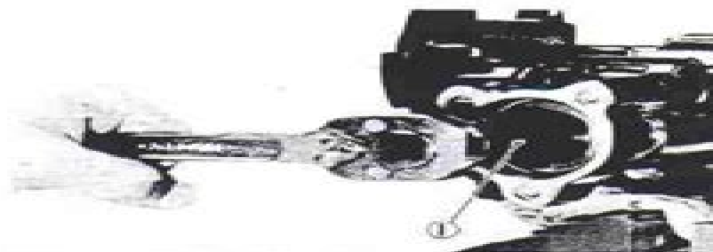
1. Hexagon Wrench (25 mm)