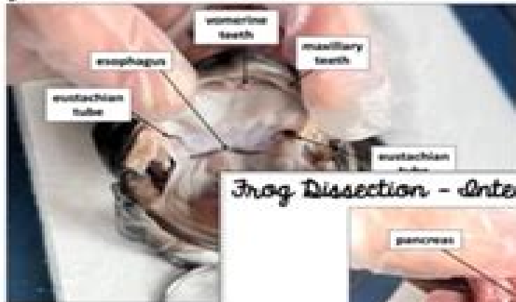
Frog Dissection - Internal Mouth