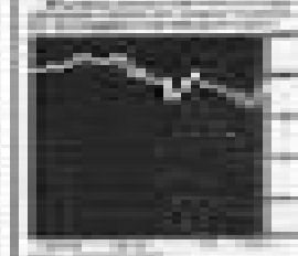
U.S. Stocks Rise on Fed's Move to Ease Monetary Policy

The Dow Jones Industrial Average rose 100.35 points to 8,014.35 today, following the Fed's decision to cut rates.