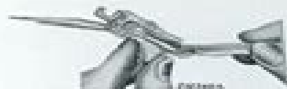
Fig. 63. Inserting Binding in Binder as German Style.

This binding is a variety of colours, cut and folded ready for use with the Binder, may be purchased in larger strips.