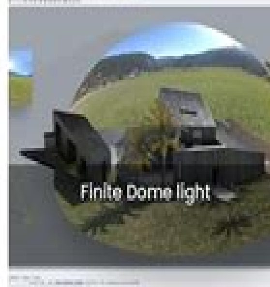
Finite Dome light