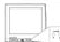
(Example of a TV)