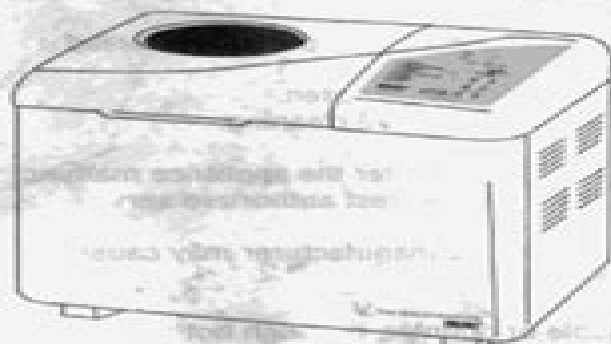
MODEL ABM3500/ ABM8200