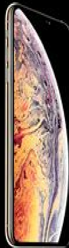
iPhone X ® Max