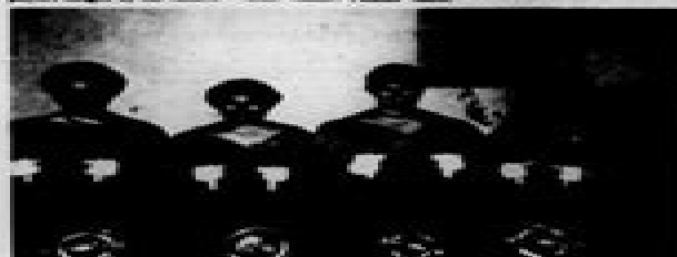
MINNEAPOLIS PUPPET THEATRE: Children perform on the stage of the First United Methodist Church, 1000 Hennepin Ave., in Minneapolis, Minn., Oct. 14.