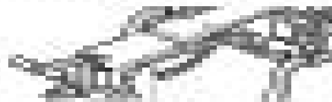
Correct Posture (Illustration Only)

Enter the serial number in the space provided for future reference.