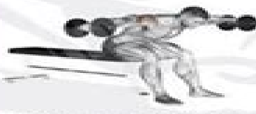
REAR DELT FLYES