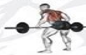
BENT OVER ROWS