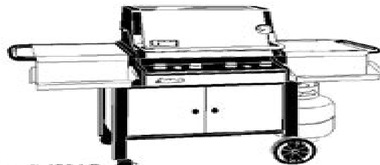
Summit 450 LP