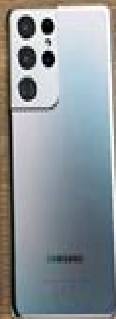
Galaxy S21 Ultra