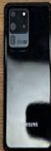
Galaxy S20 Ultra