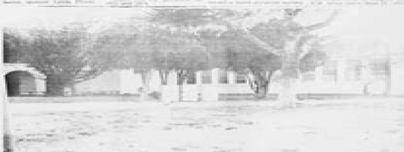
El Paso, Texas (UPI)—The El Paso Convention Center is shown in a photograph.

The man is wearing a military uniform, and he is shown in a portrait.