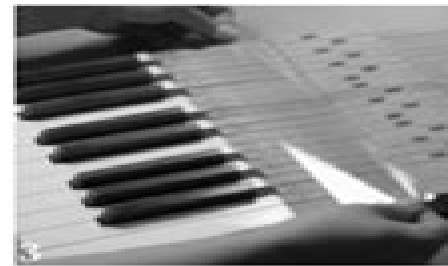
Push keys together tightly.