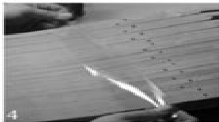
Turn over keys and tape underside.