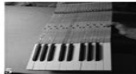
Tape keys in 4 or 5 "packs".