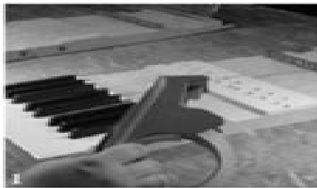
Clamp keys with packing tape.

Most photos will be self-explanatory. Please refer to the last page under Helpful Hints for more information.