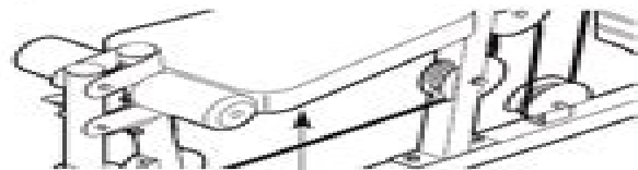
Serial Number Decal (under seat)

Write the serial number in the space above for future reference.