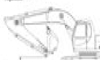
Figure 1 Measurement position, travel speed