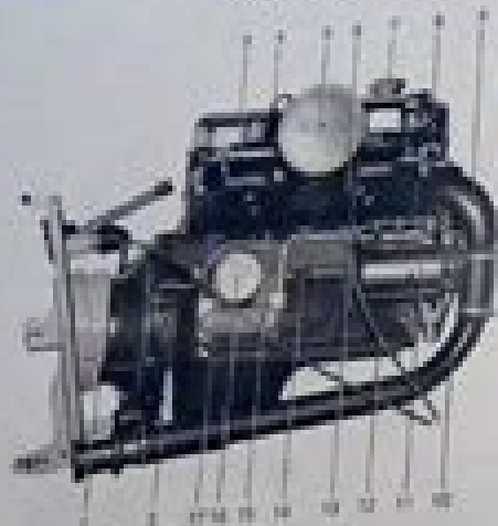
Fig. 1. 402/100. Backward view.