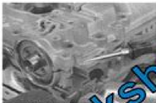
Fig. 86: Identifying Camshaft Cover Courtesy of VOLVO CARS OF NORTH AMERICA.

Slacken off the wing nuts approximately 2 turns. Repeat the procedure with the