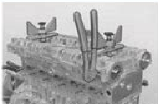
Fig. 85: Identifying Camshaft Cover, Pliers & Stop Lug

Use pliers 9995679 to lift the cover from the cylinder head.