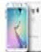
Galaxy S6 edge (CDMA)