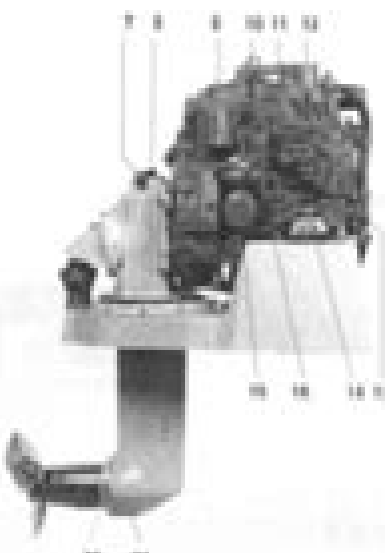
MD2012AB & MD20