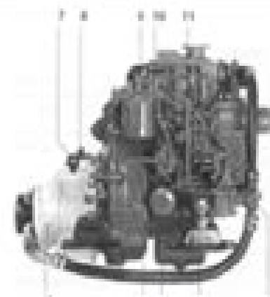
MD2012AB & MD20