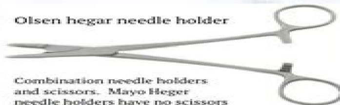
Olsen hegar needle holder

Combination needle holders and scissors. Mayo Heger needle holders have no scissors