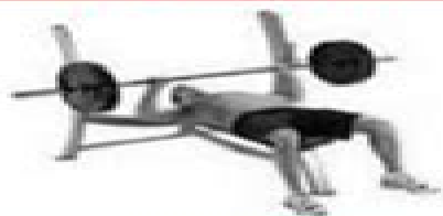
Flat Bench Press