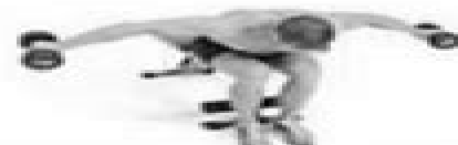
Rear Delt Fly