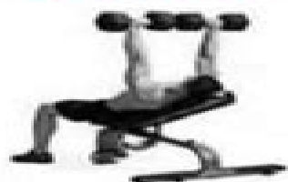
Incline DB Press