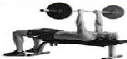
Flat Barbell Bench Press