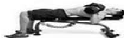
Flat DB Press