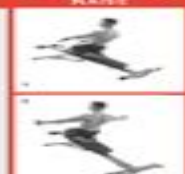
REAR DELTOID RAISE