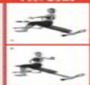
CROSSOVER PULL FEET DOWN