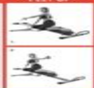
CROSSOVER PULL FEET UP