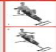
FRONT DELTOID RAISE