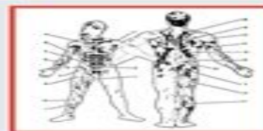
TABLE OF MUSCLES