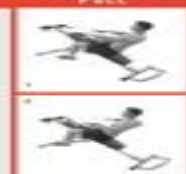
SEATED HIGH PULL