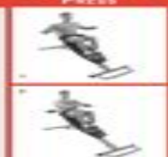
SEATED BENCH PRESS