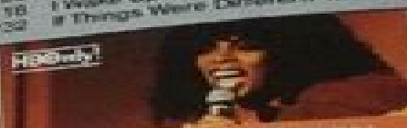
HBO Rocks Donna Summer