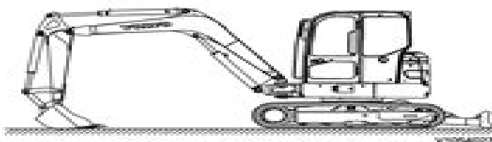
Figure 2 Service position B