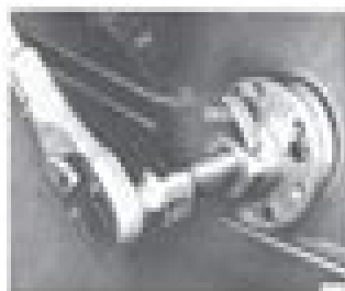
Fig. 69. Removing the pulley hub