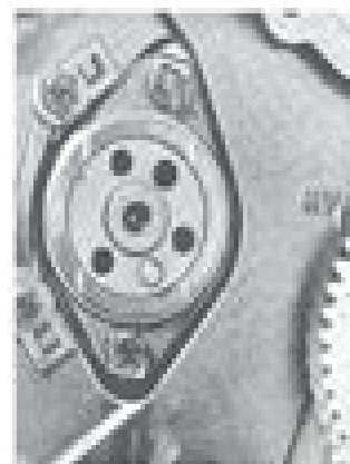
Fig. 71. Flywheel flange securing bolts (1)