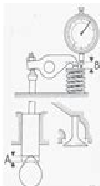
Fig. 68. Checking the lift height A. Camshaft cam height B. feeler gauge