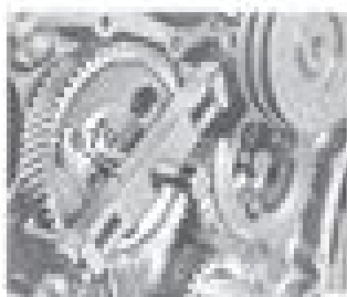
Fig. 70. Removing the camshaft gear