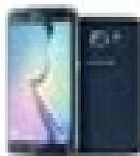
Galaxy S6 edge