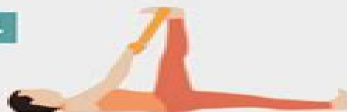
RECLINING HAND TO BIG TOE